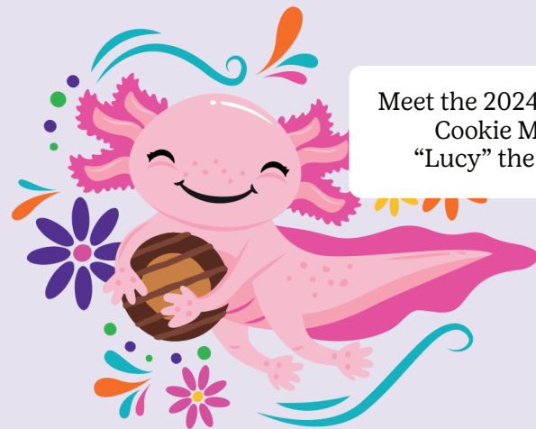
Meet the 2024 Girl Scout Cookie Mascot "Lucy" the Axolotl

This amount is invested in girls through programs, properties, volunteer support & training, financial assistance, and council services.