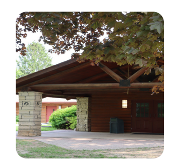
girl scouts of eastern iowa and western illinois