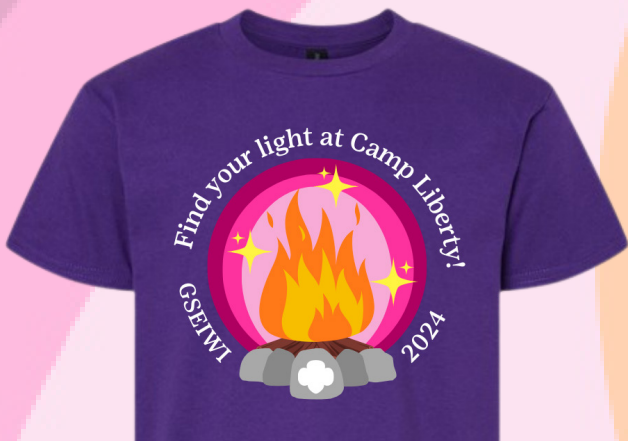
2024 summer camp shirt $15 pre-order | $20 in store