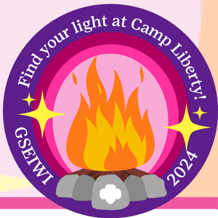
2024 summer camp patch $3 pre-order | $5 in store