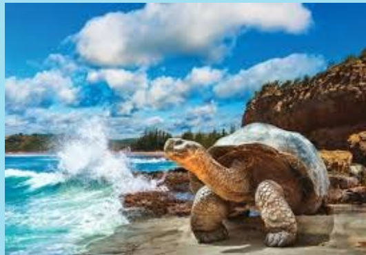
Ecuador and Galapagos June 2026