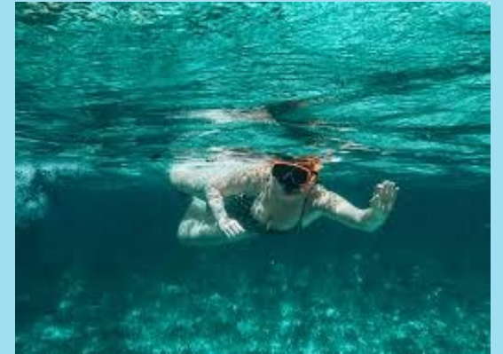
Belize June 2027