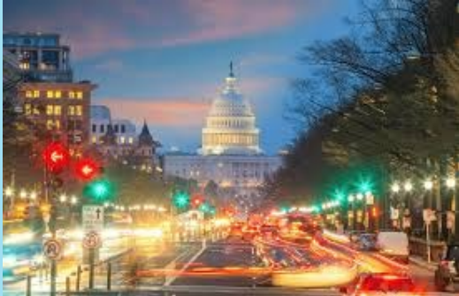
Washington DC July 2026