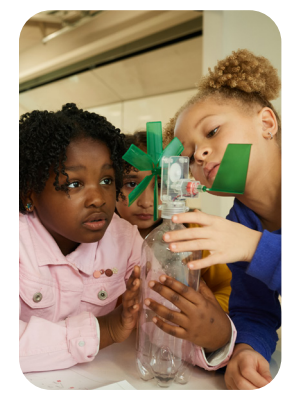
Fun Activities Research-backed programs to develop her skills