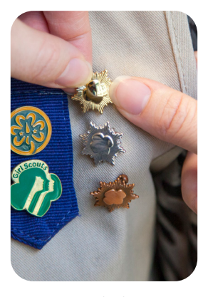
Prestigious Awards Leadership awards and scholarship opportunities